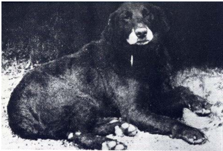
Buccleuch Avon, born 1885

By the 1880's nearly all the true Labrador (St. John's dog) lines had died out in England. A fortuitous meeting of the third Earl of Malmesbury with the sixth Duke of Buccleuch (1831-1914) and twelfth Duke of Home saved Labs from extinction. Buccleuch and Home were visiting a sick Aunt and decided to participate in a waterfowl shoot on the South Coast. There the two men were impressed by what Malmesbury's dogs were capable of doing. These were the same bloodlines as their father's kennels. Malmesbury reported that he had kept the blood lines as pure as he could with the imported dogs from Newfoundland. Malmesbury gave them some of his dogs to carry on the breeding program. The dogs were Ned (born 1882) and Avon (born 1885). Many say that these two dogs are the ancestor of all British Labs and Avon is thought to be the ancestor of chocolates. In 1903 the Labrador Retriever was popular enough to be recognized by the Kennel Club in England.