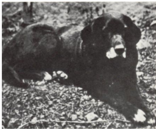
The earliest photograph of the Labrador Retriever, 1856 Nell, Owned by Earl of Home

In the 1800's the first Labradors were imported from Newfoundland to England to a few aristocratic British sportsmen. The "Labrador" was first documented under that name in 1839 in England. Black was the first documented color and was the only acceptable color at that time. It was also the commonly preferred color until more recent years, which helped the black Labrador become genetically superior in early breeding programs. During early breeding programs the yellow and chocolate puppies were 'culled' (drowned or put down). Coupled with the fact that black is the dominant color, the black Labrador has had an advantage. Many people today still favor blacks because of their regal appearance and it is common in the world of breeders to hear that the "quality is in the blacks", whether in the field or in the show ring.